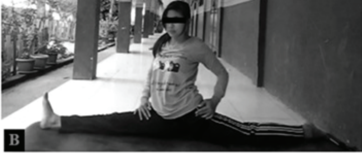
Fig. 2. (A) Forward split test position in IST test and (B) forward split test position in N-IST test